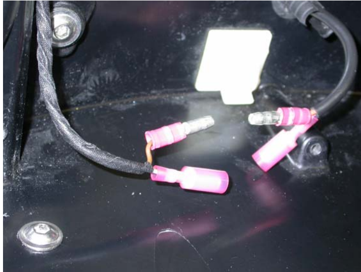
Figure 3. Bullet connectors installed