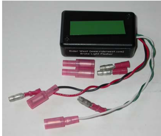
Figure 1. Brake light flasher for center brake light

The brake light flasher makes the brake light flash for a few seconds, and then it stays on for as long as the brake is applied. The cycle repeats every time the brake is applied.