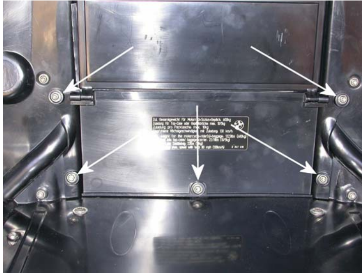
Figure 2. Remove 5 screws to remove plastic cover